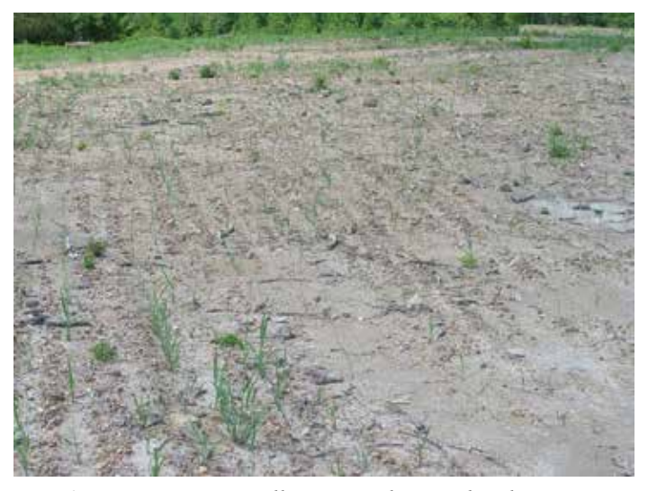
Fig. 1. Native grass seedlings are slow to develop. However, on this clean, firm, conventionally prepared seedbed, these small seedlings will develop into a goodquality forage stand.

Broomsedge, johnsongrass and dallisgrass can all compete aggressively with NWSG. Where any of these are present, plan to spray during August the year BEFORE planting. For johnsongrass or broomsedge, 1 - 2 qt/ac (for 4 lb active ingredient/gal formulations) glyphosate will be adequate, but for dallisgrass or bermudagrass (see sidebar, "Controling bermudagrass"), rates of up to 5 qt/ac will be