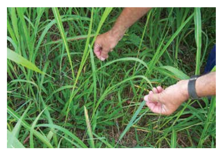
Fig. 3. Even though large switchgrass seedlings (being held in each hand, above) have developed as a result of this planting, the weed canopy was allowed to overtop the seedlings. When this occurs, there is little chance of a successful stand. These weeds MUST be controlled in a timely manner.

By mid- to late-August, you will be at a point where further weed control does not matter and the grass can be allowed to compete with whatever is out there. If your first-year stand has substantial weed pressure going into fall dormancy, consider using a prescribed burn the following April when the NWSG is just beginning to grow. Such fires can be helpful in weed control.