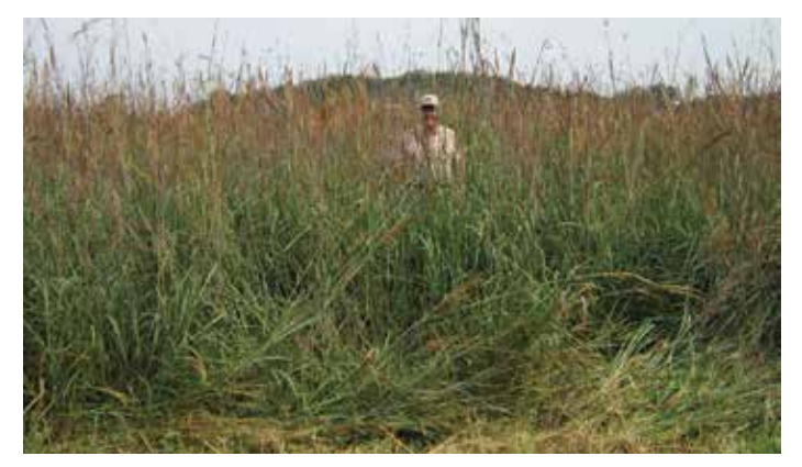
Fig. 4. This first-year stand was drilled into a high quality seedbed during late April. With good competition control and adequate rainfall, such stands can be established and provide excellent forage for years to come.

Before any herbicides are used, you should consider the palatability of any weeds you may be planning to treat.