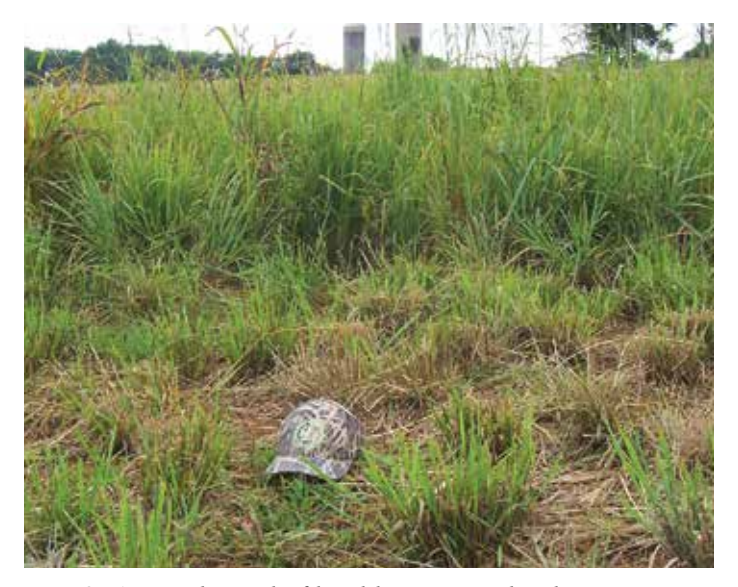
Fig. 8. A mixed stand of big bluestem and indiangrass harvested for hay on July 1, five days before photo was taken. Note clumps in the foreground that were cut to about 8 inches residual height. Regrowth has already begun because the growing points were not removed.

the early portion of the growing season is not strongly influenced by spring rains. During mid and late summer, though, rainfall exerts greater influence.