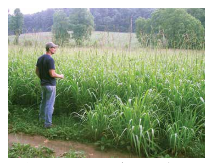
Fig. 6. Eastern gamagrass is a robust grass with an unusual seed head that is the earliest of the NWSG to come out, typically in late May.