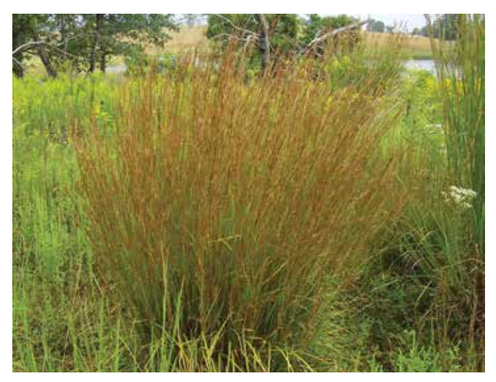
Fig. 4. Little bluestem, as its name implies, is shorter than the other NWSG, but still retains the "bunch" growth habit common to these species.

As with any forage grass, there is a trade-off between forage quantity and quality. For most forage grasses,