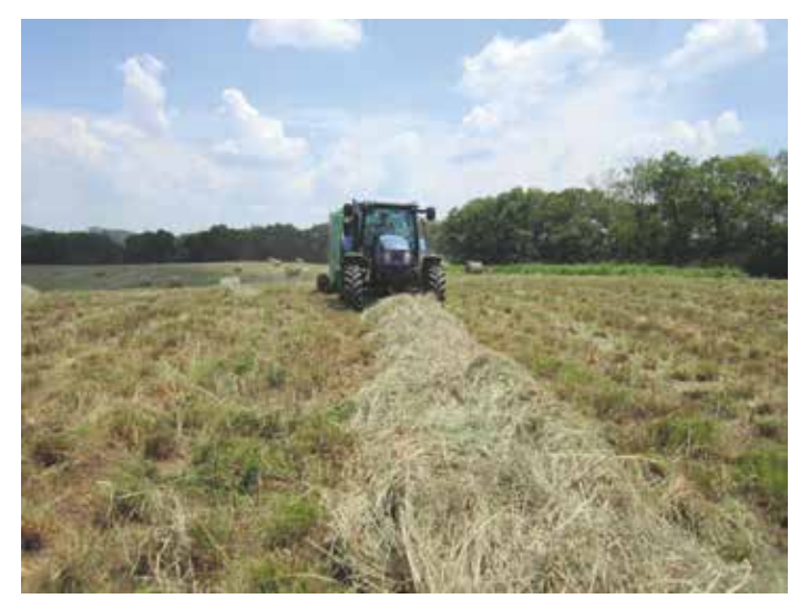
Fig. 9. This big bluestem/indiangrass blend hay was handled easily with traditional hay production equipement.

the larger stems. In many cases, disc mowers cannot be easily raised high enough for the desired 8-inch cutting height. A boot can be easily fabricated to solve that problem.