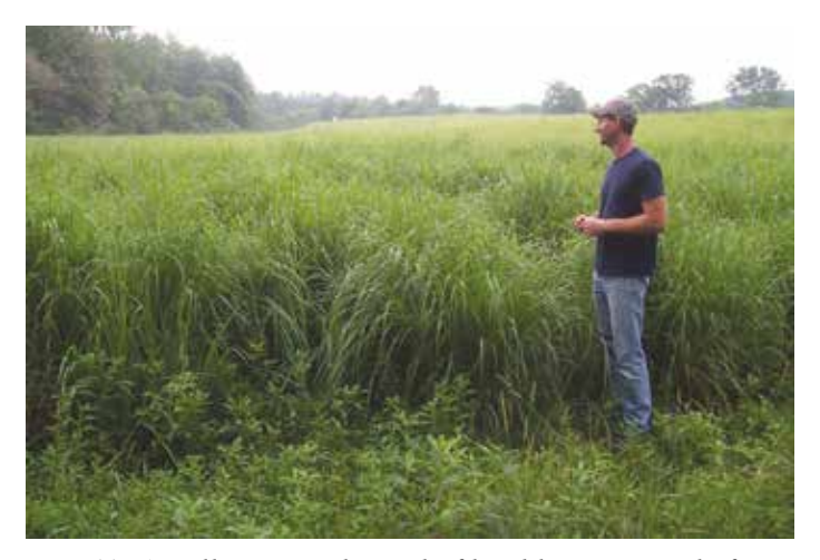
Fig. 11. A well-managed stand of big bluestem ready for harvest in central Kentucky. Photo taken on July 5. Native warm-season grasses can be quite productive in the Mid-South, providing high-quality forage during hot, dry summer months.

good guideline is to fertilize once the stand is about 12 inches tall and outgrowing weeds. Also, evidence shows such early applications are preferable to mid-season applications. Do not apply P and K unless they test in the low category. If they do test low, follow soil lab recommendations for supplementing P and K.