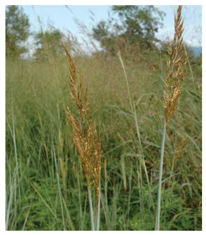
Fig. 5. Indiangrass can be recognized by its pale green stems and golden head. The seedhead appears in August, later than the other NWSG.

including NWSG, harvesting during the late-boot or early-seedhead emergence stages provides an optimum combination of quality and quantity (Fig. 7). Because NWSG can become quite stemmy as they begin seedhead development, it is important not to delay harvest beyond the late-boot stage. This is particularly true with switchgrass, but is also a concern with indiangrass and big