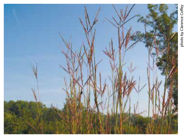
Fig. 3. Big bluestem can be recognized by its "turkey foot" seedhead, which comes out in late June through July.

Drought and Native Warm-season Grasses The summer of 2007 was the single worst drought year recorded in Tennessee and provided an unusual opportunity to measure drought tolerance. This example comes from a switchgrass biofuel trial that was being conducted in West Tennessee during 2004 – 2008. In this study, switchgrass, which was harvested only once each year in the fall, yielded about 8 tons of biomass per year. During 2007, the yield dropped, but still remained at 5.3 tons/acre!