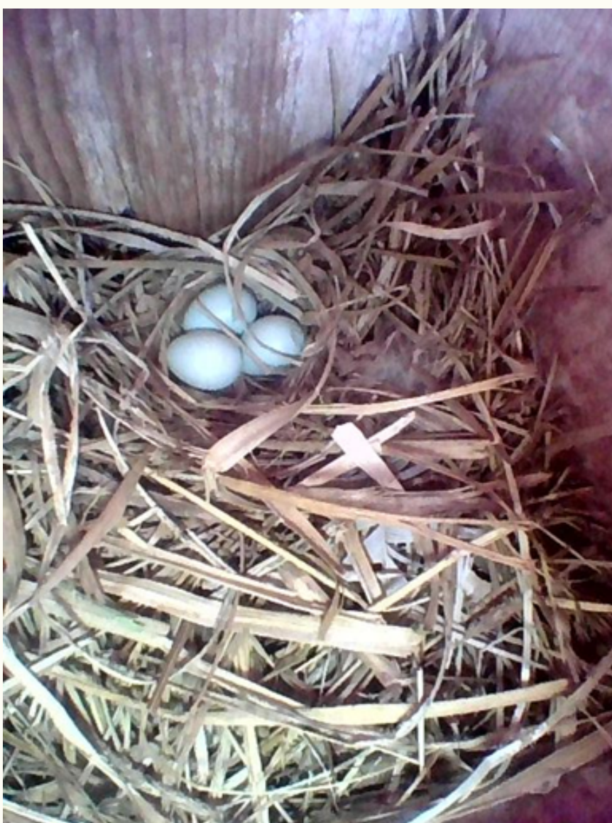
Starling nest with eggs

The nest box acts as a surrogate cavity in a tree, and there are a lot of other critters in need of cavities, so it's very common for something else to start using an empty box.